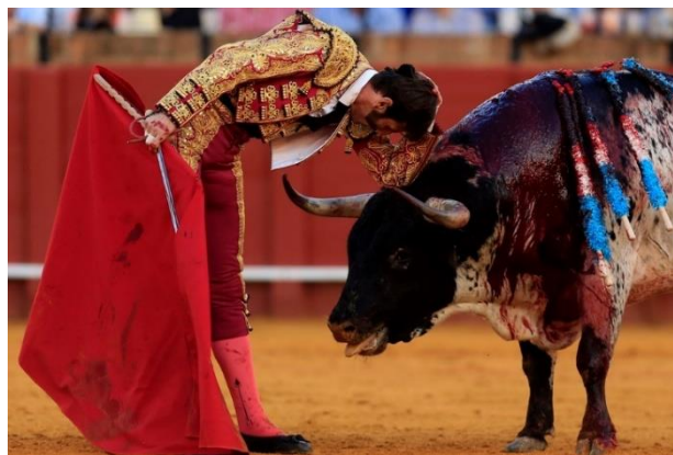
Spanish matador Juan Jose Padilla leans on a bull during a bullfight at The Maestranza bullring in Seville